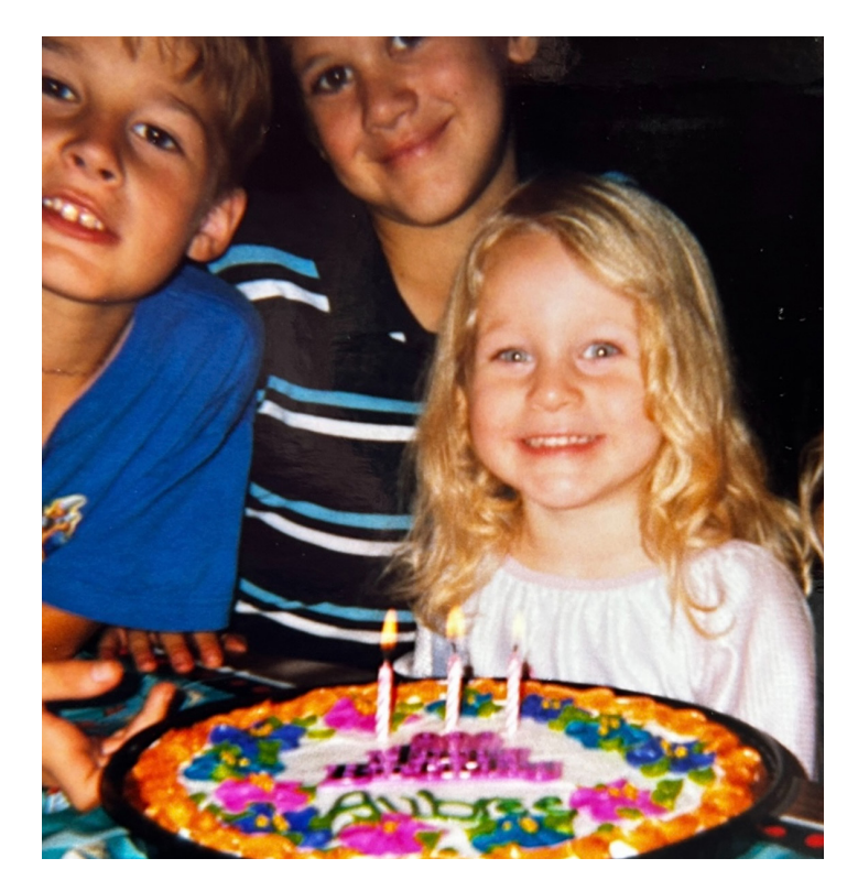
"You're helping the little girl in me achieve things I never thought I could."