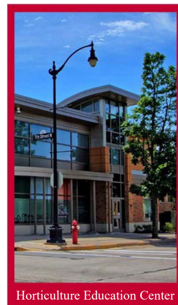
Horticulture Education Center

15. Horticulture Education Center: Located at 624 Vine Street, this new 11,121 square foot facility (Headhouse 3,467 square feet, Greenhouse 7,654 square feet) allows access for Western programs, including Landscape Horticulture, Culinary, and Science. Western, Hillview Urban Agriculture Center, and Mayo Clinic Health System-Franciscan Healthcare, have developed a unique partnership with this facility to promote healthy eating habits and foster education about gardening, agriculture, and sustainable practices.