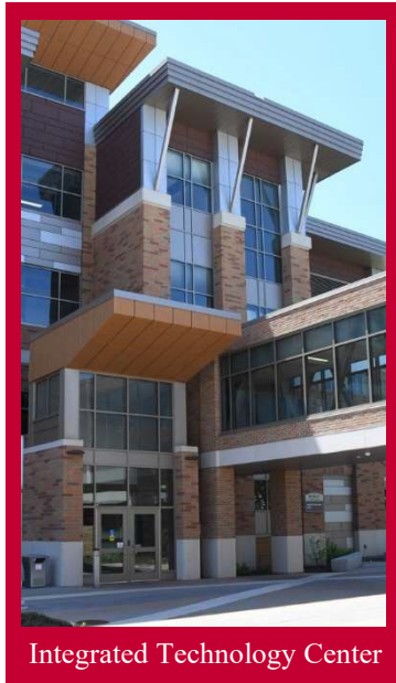
Integrated Technology Center

The extensive remodel of the first two floors, and the addition of two floors included rigorous efforts to increase energy savings and reduction of materials intended for landfills. The building is certified as LEED Platinum.